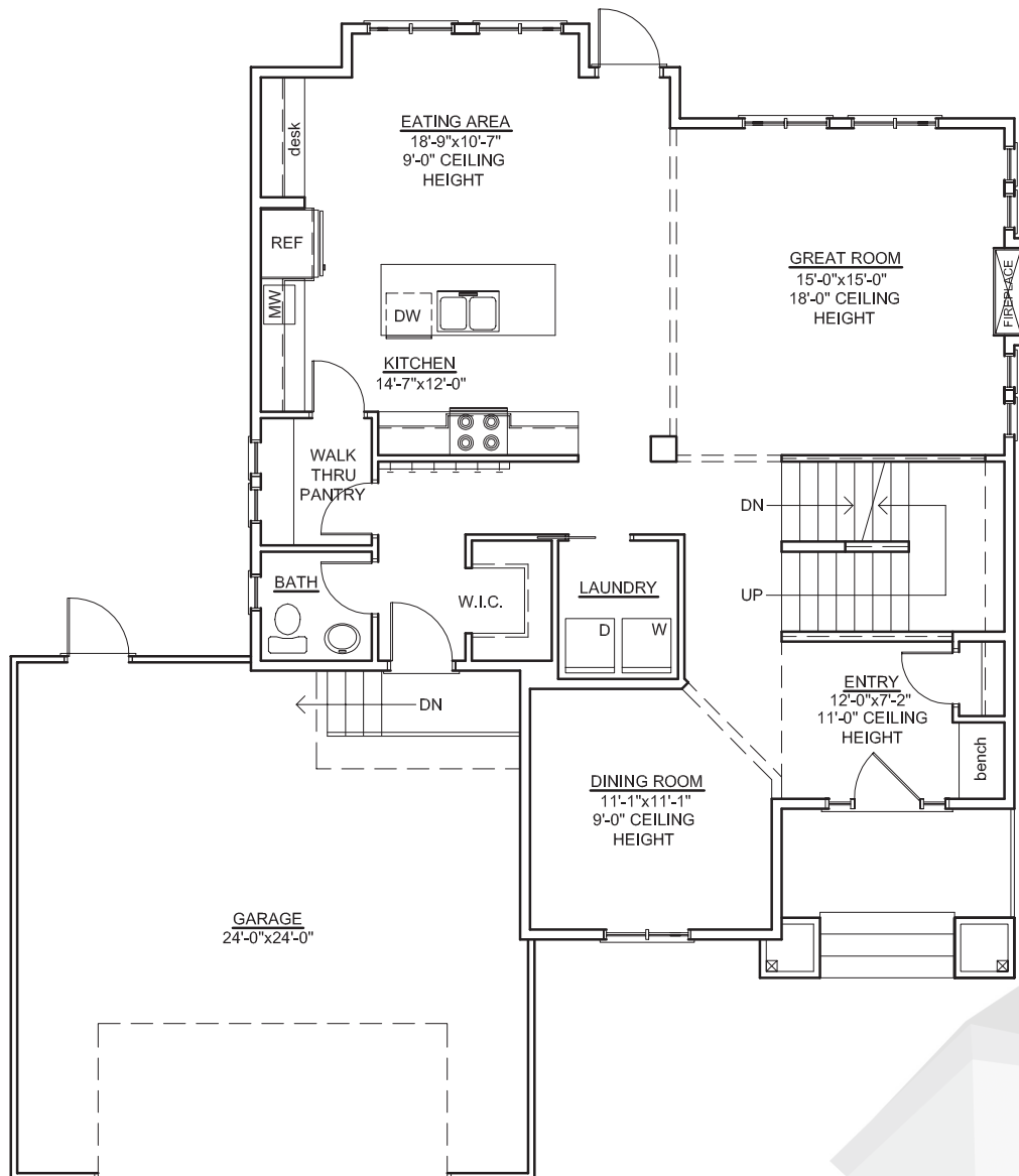
MAIN FLOOR PLAN 1900 SQ FT